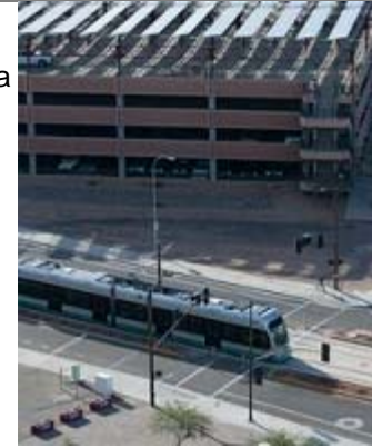
The Tempe campus Stadium Parking Structure solar installation is one of more than 45 installations across three ASU campuses that contribute to a solar-generation capacity of over 10 megawatts.

Read the SEPA press release , read about ASU topping 10 megawatts of solar-generation capacity, and learn more about ASU's solar program.