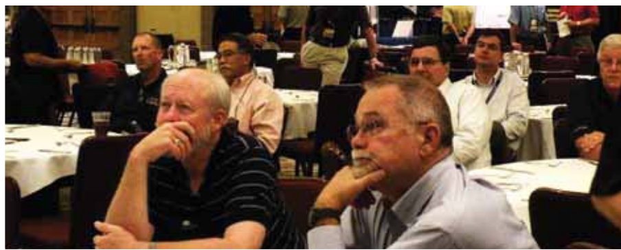
Deep concentration at a Techie Talk during a Business Partner break.

Throughout the year, the RMA Board of Directors (BOD) developed a new strategic plan. The BOD agreed on the following mission statement: The mission of RMA is to elevate the leadership and influence of facilities professionals. The BOD decided that the "center of gravity," i.e., the single most important factor affecting RMA's future success was "the needs of our constituents." That is, all other efforts would be meaningless if we do not first address the needs of our constituents. The BOD also conducted a SWOT analysis (strengths, weaknesses, opportunities, and challenges) and reviewed characteristics of success in order