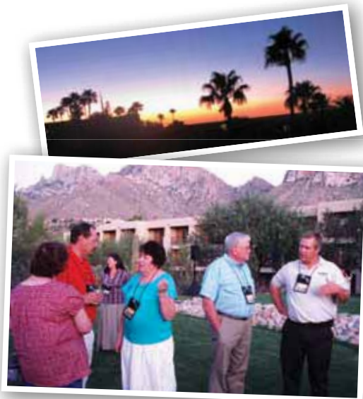
Social time during the sunset toast.