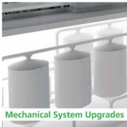
Mechanical System Upgrades